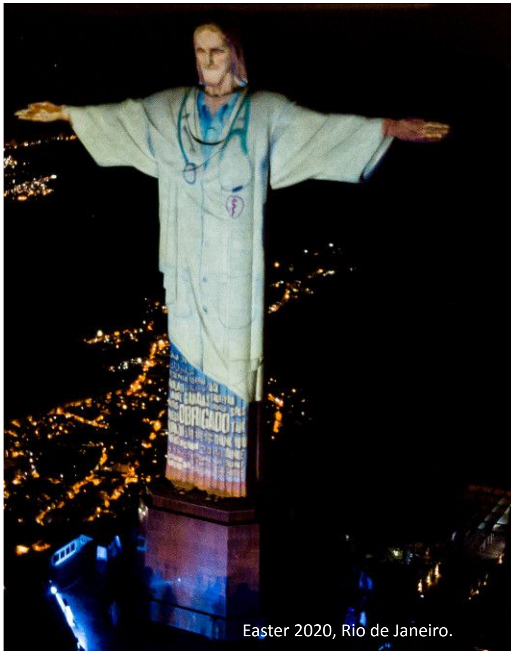
Easter 2020, Rio de Janeiro.